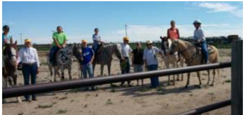
One of the many groups to visit Blue Rose Ranch this summer was the Baca County Library Summer Reading Program – a 10-12 year old group, dubbed “the Olympians”. Blue Rose Ranch promotes literacy by hosting the Imagination Library, and the summer reading program was a natural outreach. After their safety lesson, “the Olympians” learned how to lead a horse. They also enjoyed riding the horses. They have been invited to become involved in our youth riding program.