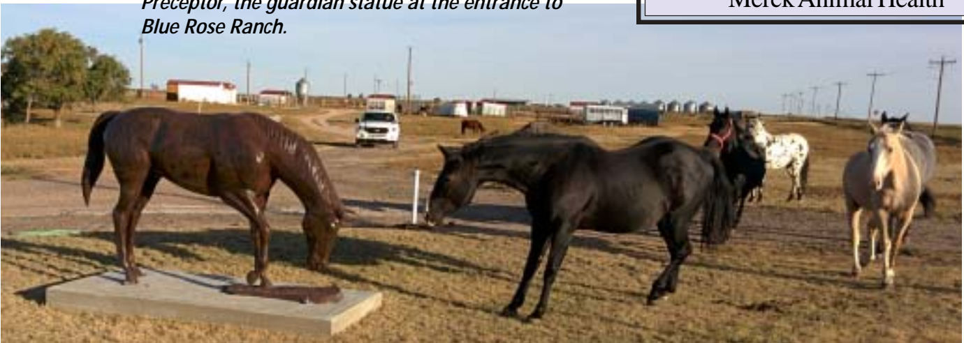
A favorite photo of ours shows Midnight meeting Preceptor, the guardian statue at the entrance to Blue Rose Ranch.