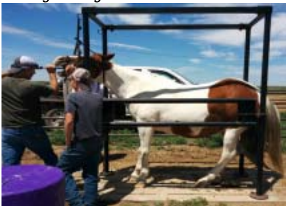
Chief demonstrates the strength of our vet examination chute during our Annual Horse Health Day, held in May. He clearly wants to get away from the dental drill!! Horses receive wellness examinations, vaccinations, worming medication, and teeth checks on Horse Health Day.