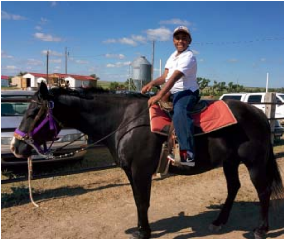
Midnight pictured during our 2015 Youth Horse Camp.