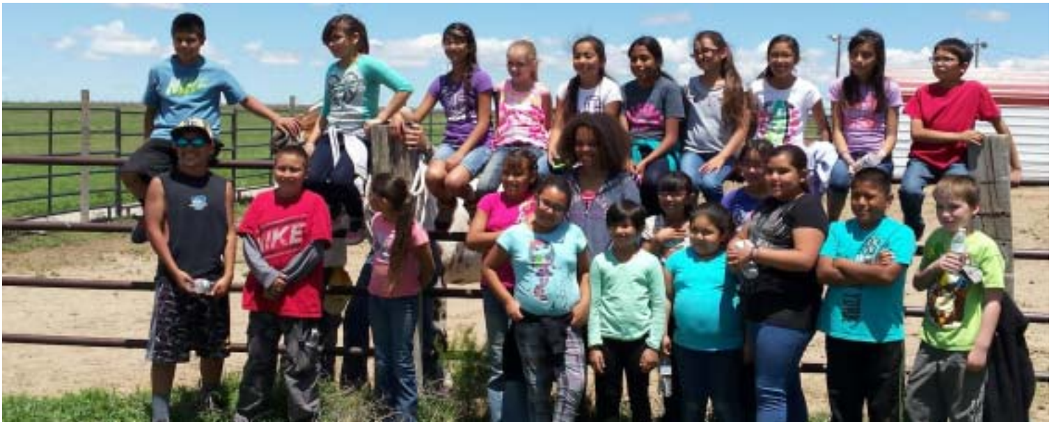
This summer we hosted the HOPE group from Lamar, CO. HOPE is an afterschool program for mostly lower income kids. Some of them had never seen a horse before. Coming to Blue Rose Ranch was a once-in-a-lifetime opportunity. Matching these young people to horses was magical and their enthusiasm was contagious. The blessing was ours.