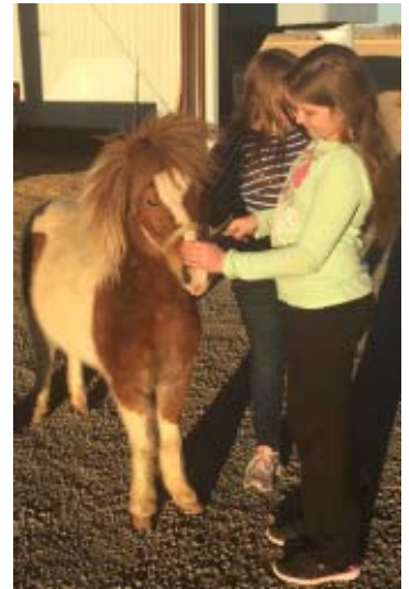
Little Chief and Little Einstein with their Family