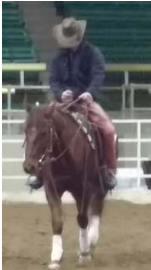
Lucky during his award winning performance at the Horse Expo in Denver. Lucky's journey from an abandoned horse on the prairie to becoming a highly valued team roping competitive horse is what Blue Rose Ranch is all about.