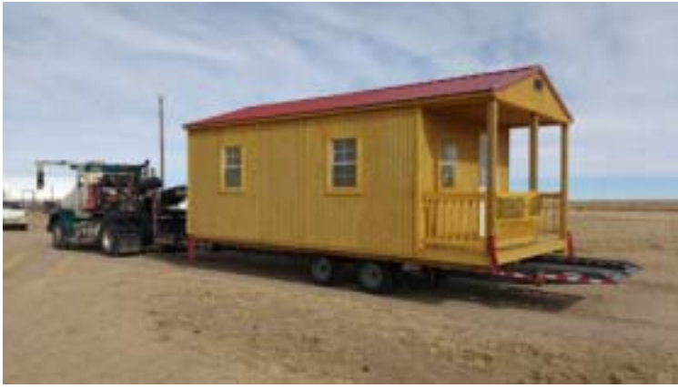
Arrival of Office Building