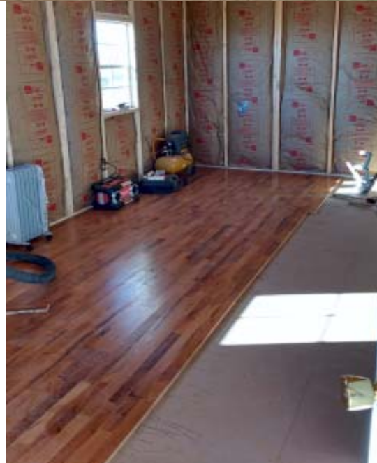
Installing the Floor