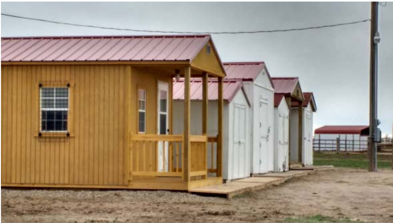
The Town of Blue Rose