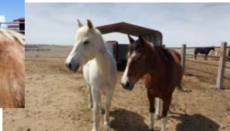
Sage and Jewel